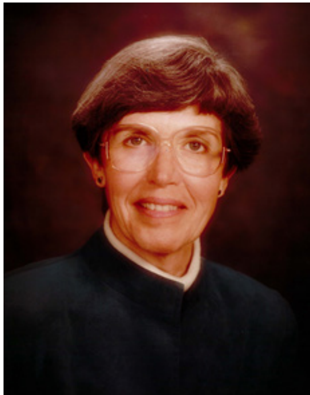
Joan Lincoln, Mayor 1984-86 September 3, 1927 - March 7, 2016